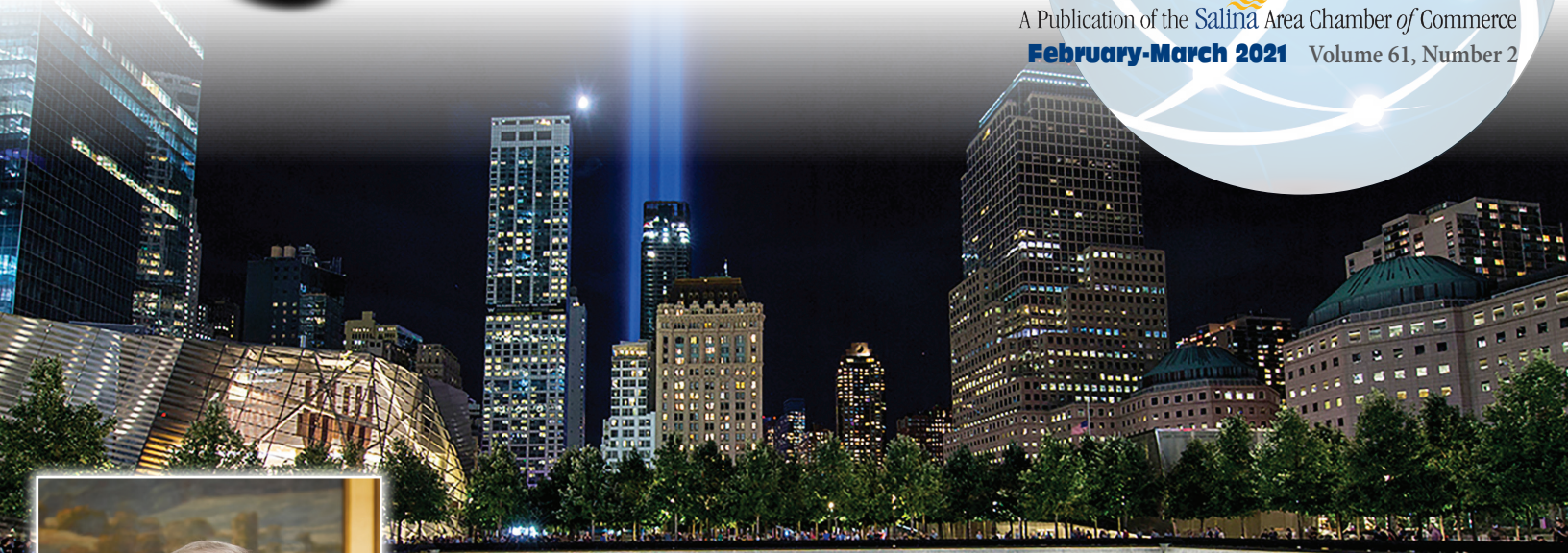
9/11 Memorial and Museum

A Publication of the Salina Area Chamber of Commerce February-March 2021 Volume 61, Number 2