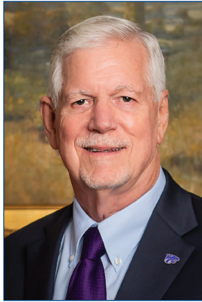
Richard B. Myers President, Kansas State University Four-Star General, USAF, Ret'd 15th Chairman, Joint Chiefs of Staff

General Richard B. Myers, (USAF, Ret.) returned to his home state and alma mater to serve as Kansas State University's 14th President. He graduated