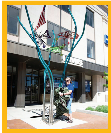
“Butterfly Tree” being unwrapped in 2021. It was voted People’s Choice!

Visitors are encouraged to pick up a Walking Tour/Ballot from the silver boxes at the mid-block pedestrian crossings, many of the downtown merchants or at the Visit Salina Info trailer located in ‘67401 Plaza’ – the parking lot north of Ad Astra Books and Coffeehouse at 141 N. Santa Fe. Then, walk the SculptureTour and vote for your favorite piece. Or,