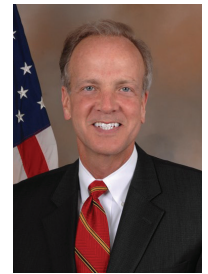
U.S. Senator Jerry Moran

Kansas State University Salina Aerospace and Technology Campus has a modern fleet of more than 30 aircraft and is located adjacent to a 12,300-foot runway. The wide variation in climate provides students flight experience in diverse weather such as high winds, convective activity, low visibility, heat and cold operations. Our training environment prepares a versatile pilot ready for NOAA service.