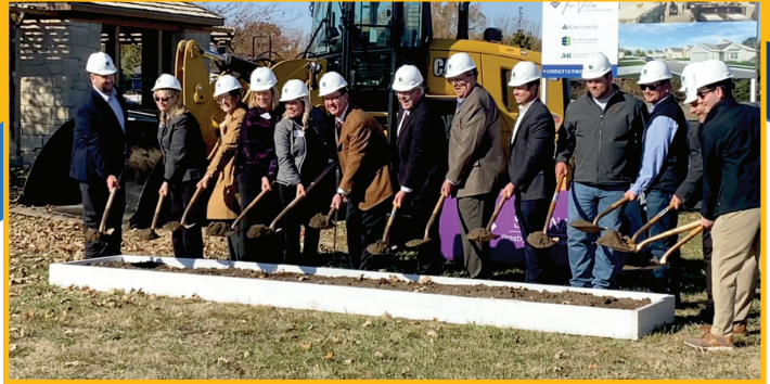
Groundbreaking Celebration to officially announce The Villas at Salina Presbyterian Manor was held on Tuesday, November 1, 2022.