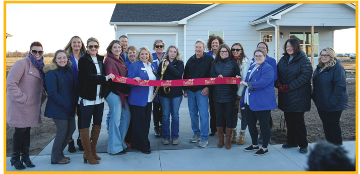
A Ribbon Cutting was held on Tuesday, November 15th for South View Estates . South View Estates LLC is a group of developers who have come together to create housing opportunities in South Salina with the help of the Moderate Income Housing Grant. This area consists of townhomes and single-family homes.