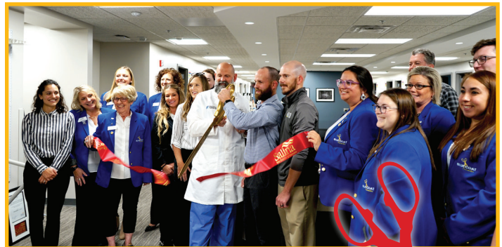
On Thursday, November 3rd, Salina Regional Orthopedic and Sports Medicine Clinic , located at 520 S. Santa Fe. On the 4th floor, held a combined Business After Hours and Ribbon Cutting to celebrate their new facilities.