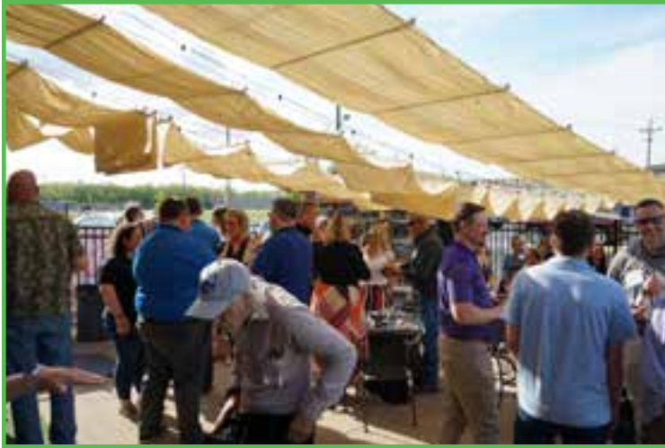
Big Booty Trudy's had a great BAH event on May 4. Attendees enjoyed great refreshments and live music on their outdoor patio.