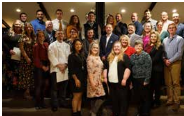
Leadership Class of 2022