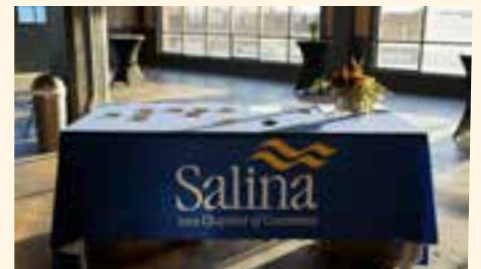
Answer: The Sullivan!

Salina Family Healthcare Center and American Heart Association are presenting CPR/AED/First Aid classes at the Salina Family Healthcare Center, 651 E. Prescott. The cost is $75 per person, and the certification is good for two years. Registration is required by contacting Outreach Dept. at 785-825-7251, ext 642. Dates for classes are: Saturday, June 3, 8am-Noon; Wednesday, June 7, 1-5pm; Saturday, July 8, 9am-1pm; and Tuesday, June 11, 5-9pm.