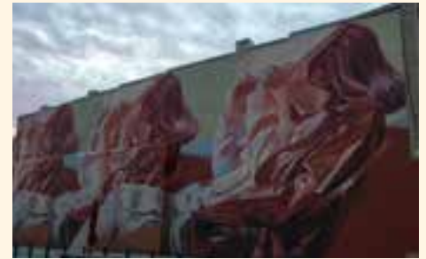
Answer: Campbell Plaza Downtown!

Crown Distributors earned SHARP (Safety & Health Achievement Recognition Program) accreditation, only the 2nd beverage wholesaler in the state of Kansas. The program recognizes small business employers who have used OSHA's On-Site Consultation Program services and operate exemplary safety and health programs. Acceptance of a worksite into SHARP from OSHA is an achievement of status that singles out businesses as models to their peers as for worksite safety and health.