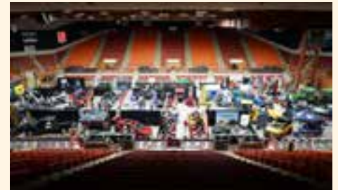
Answer: Mid-America Farm Expo at Tony's Pizza Events Center!

Salina Family Healthcare Center and American Heart Association are presenting CPR/AED/First Aid classes at the Salina Family Healthcare Center, 651 E. Prescott. The cost is $75 per person, and the certification is good for two years. Registration is required by contacting Outreach Dept. at 785-825-7251, ext 642. Dates for classes are: Saturday, June 3, 8am-Noon; Wednesday, June 7, 1-5pm; Saturday, July 8, 9am-1pm; and Tuesday, June 11, 5-9pm.