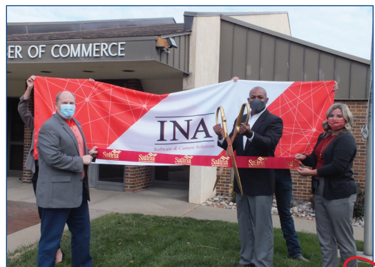
INA Alert, Inc. , Ellinwood, KS celebrated expanding their territories with a ribbon cutting at our Chamber office. Congratulations!