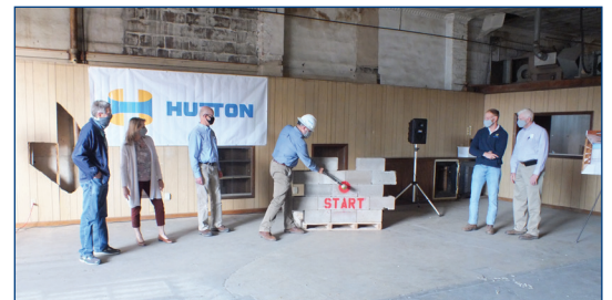
Hutton celebrated their new office in Salina, 137 S. Fifth Street, with a 'groundbreaking.' Congratulations!