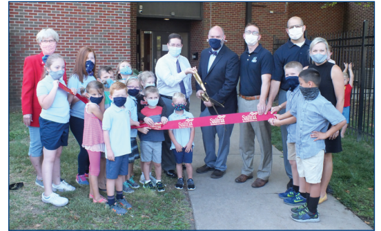
Cornerstone Classical School , 830 S. Ninth Street, held a ribbon cutting on September 5th to celebrate the purchase of the former Franklin school building this past June. Congratulations to Cornerstone!