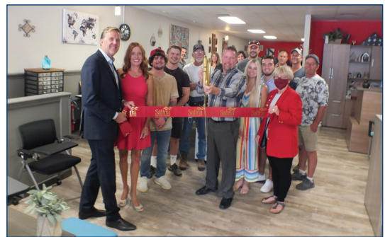
One Office Solution , 111 S. Santa Fe, celebrated their grand opening with a ribbon cutting and open house on October 9th. Welcome to Salina!