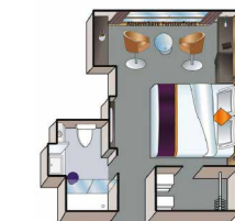
Stateroom Strauss & Mozart Decks (188 sf)