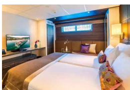
Stateroom Haydn Deck (172 sf)

SUITE - 284 SQ FT WITH BALCONY All suites are on the Mozart Deck and have panoramic windows with exterior Walk Out Balcony, two twin beds that can be separated or put together, a private sitting area, flat screen TV, mini-bar, private bath with shower, hair dryer, phone, closet, desk, chair, safe & offer 284 square feet of floor space. (Suite size and amenities can vary)