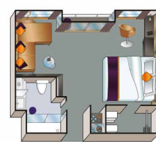
Suite Mozart Deck (284 sf)