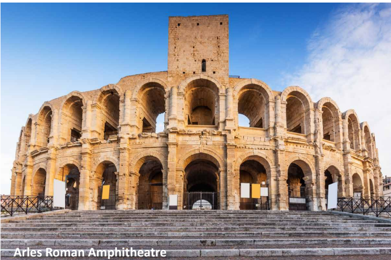
Arles Roman Amphitheatre